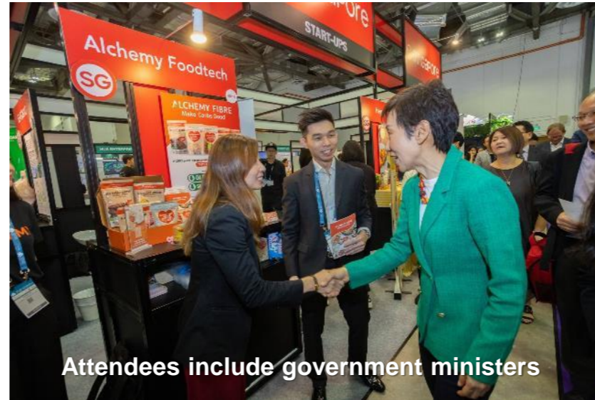
Attendees include government ministers