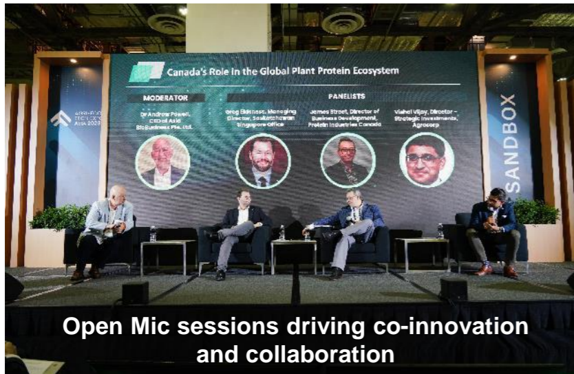
Open Mic sessions driving co-innovation and collaboration